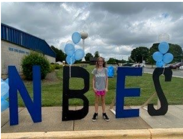
North Brook 5th Grade Graduation 2019-2020

North Brook Elementary will provide a rigorous and relevant curriculum targeting twenty first century skills. We will collaborate with all stakeholders to create a safe, nurturing, and engaging environment where students are empowered to discover their strengths, reaching their maximum potential and by becoming responsible, productive citizens and lifelong learners.